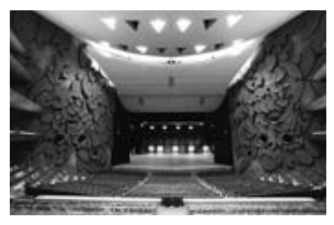
Tokyo Bunka Kaikan after the refurbishment (Main Hall

Going forward, in the design and construction of various facilities, SNK intends to utilize the experience gained through this project and the detailed operational data obtained after the project's completion.