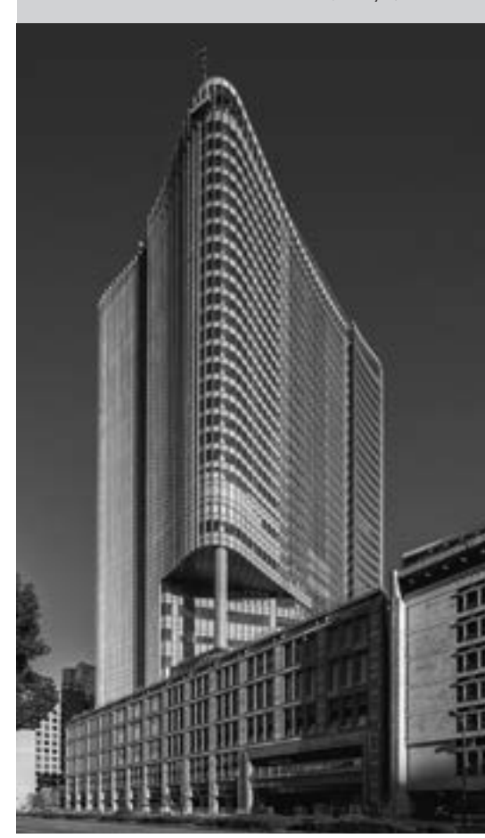
New Engineering Building for KASAI KOGYO (Kanagawa Prefecture)